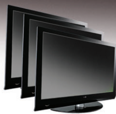
60" & 32" PLASMA TV